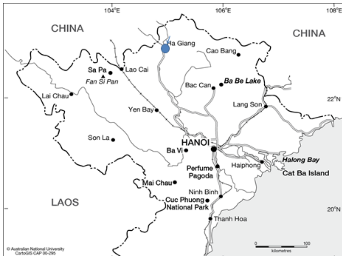
Figure 3. Distribution of Camellia hagiangensis , location in Ha Giang province is marked by blue rounds